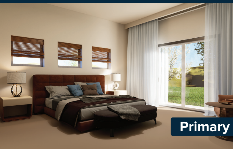
Primary En Suite