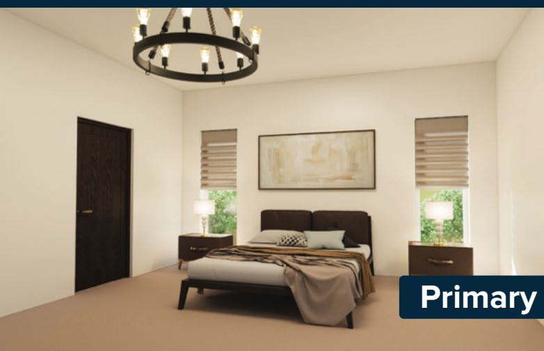
Primary En Suite