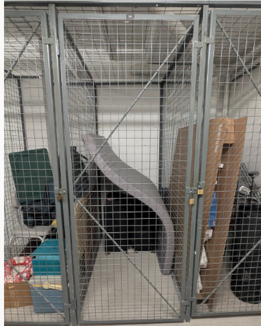
1 Locker Level P2 #105 H 7'4" x W 2'8" x D 5'3" Ft (Approx)