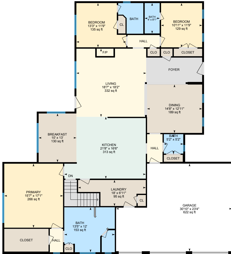
Main Floor Finished Area 2414.97 sq ft

Main Building: Above Grade Finished Area 2414.97 sq ft